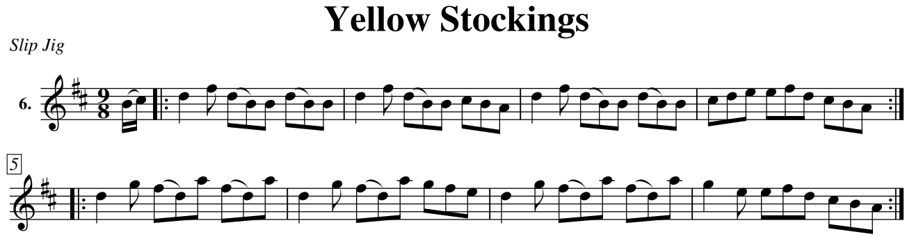
Book: Ryan's Mammoth Collection (1883) Transcribed by: AK/Fiddler's Companion