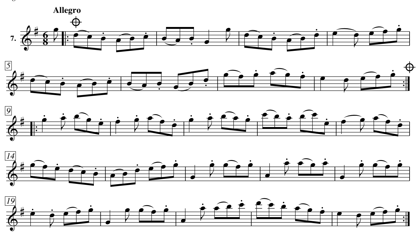
Book: J. Clinton - Gems of Ireland: 200 Airs (1841, No. 175, p. 90)