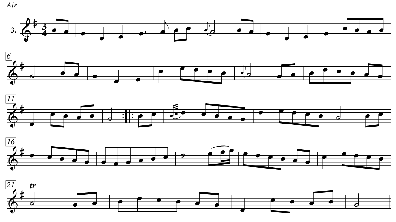
ABC source: Geoghegan - Compleat Tutor for the Pastoral or New Bagpipes (c. 1745-46) Transcribed by: AK/Fiddler's Companion