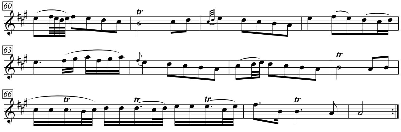
ABC source: McGibbon - Scots Tunes, book III, p. 68 (c. 1762) Transcribed by: AK/Fiddler's Companion