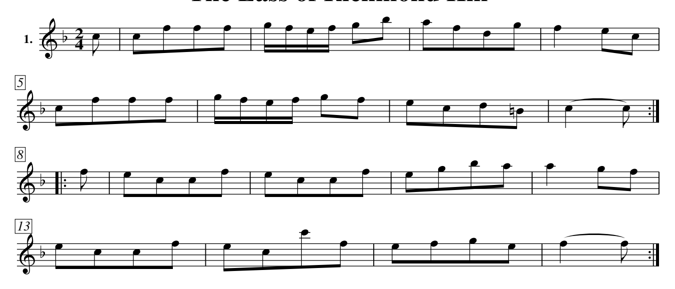
The Lass of Richmond Hill