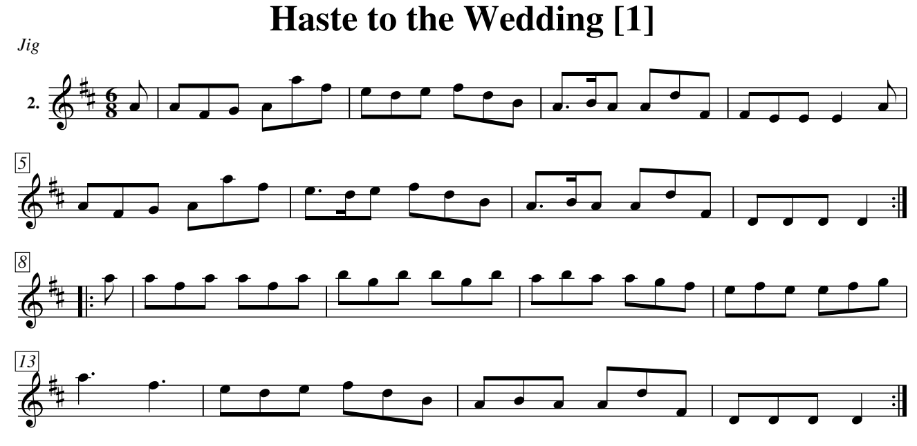
Book: John Baty music manuscript collection (Northumberland, c. 1840-60, No. 30) Transcribed by: AK/Fiddler's Companion