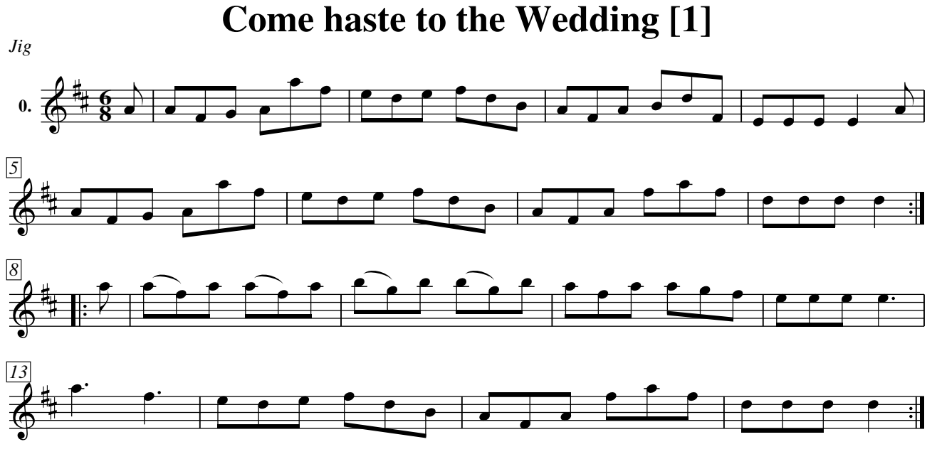
ABC source: William Clark of Lincoln music manuscript collection (1770, No. 25) Transcribed by: AK/Fiddler's Companion