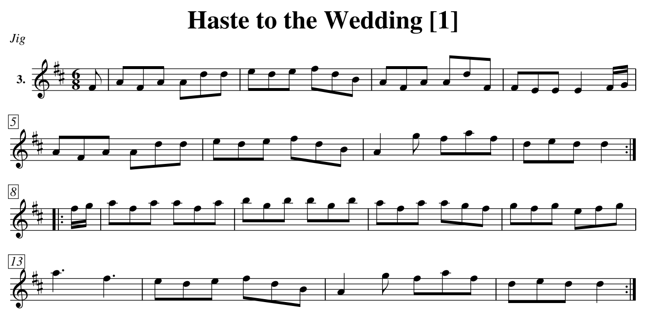
ABC source: The mid-19th cent. music manuscript collection of James Goodman (County Cork, p. 110) Transcribed by: AK/Fiddler's Companion