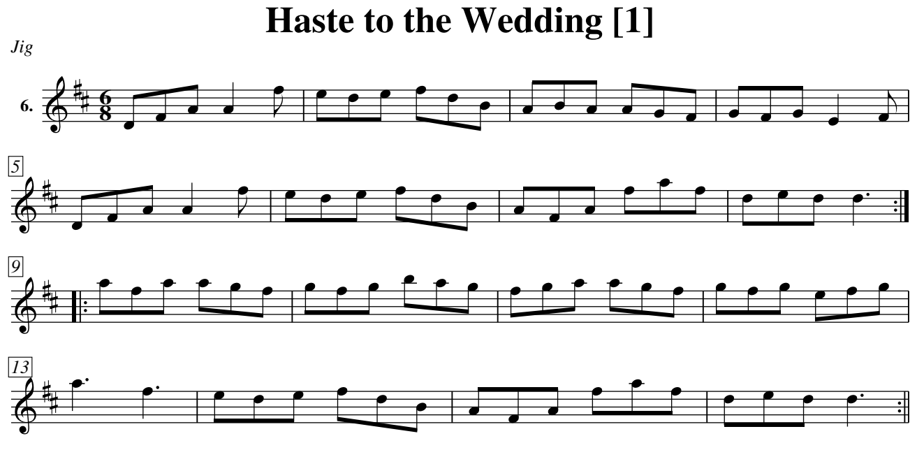
Book: Sharp - Morris Dance Tunes. (1909)