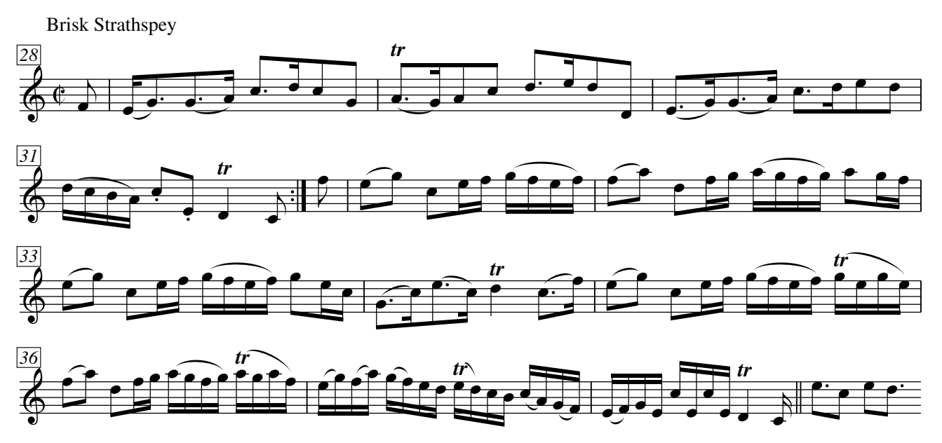
Book: Joshua Campbell - A Collection of New Reels & Highland Strathspeys (Glasgow, 1789, pp. 26-27) Transcribed by: AK/Fiddler's Companion