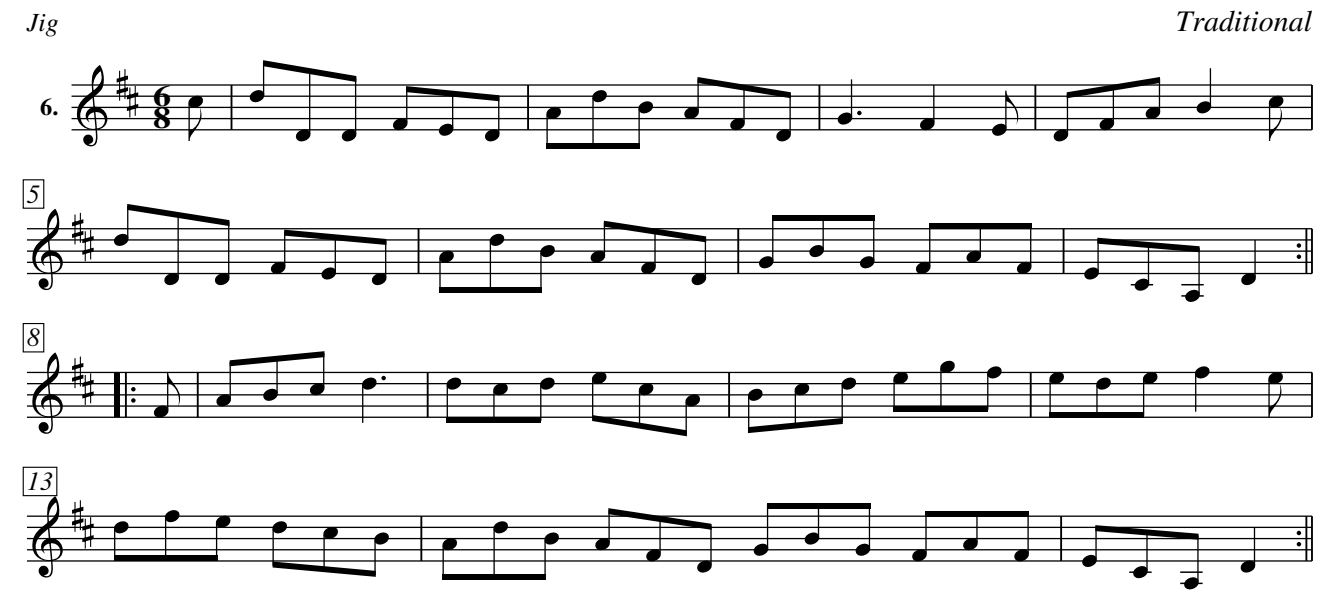
Making Babies by Steam