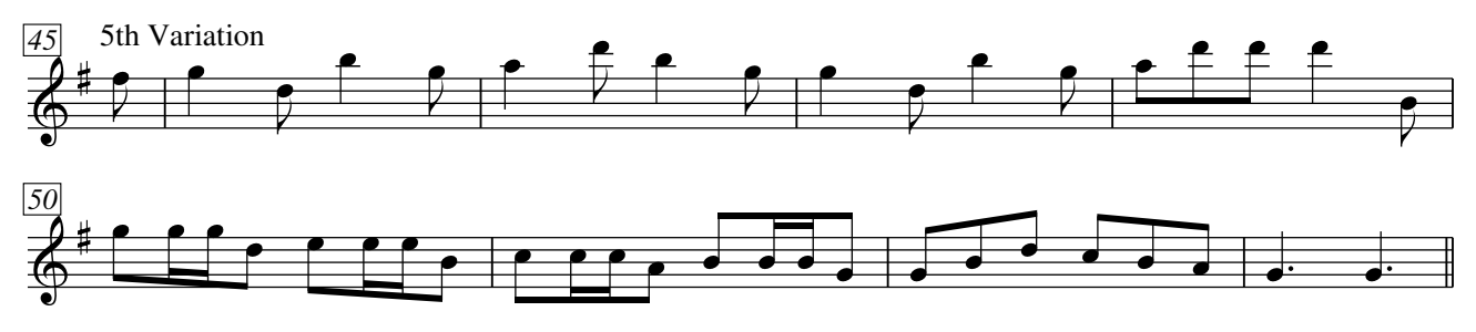
Book: Stephen Grier music manuscript collection (Book 3, c. 1883, No. 33, p. 12) http://grier.itma.ie/book-three#?c=0&m=0&s=0&cv=11&z=109.9507