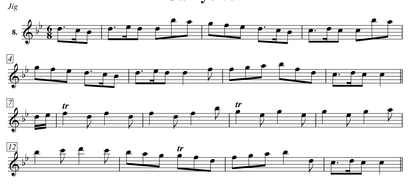
Book: P.H. Hughes - Gems from the Emerald Isle (London, c. 1860?, No. 35, p. 9) Transcribed by: AK/Fiddler's Companion